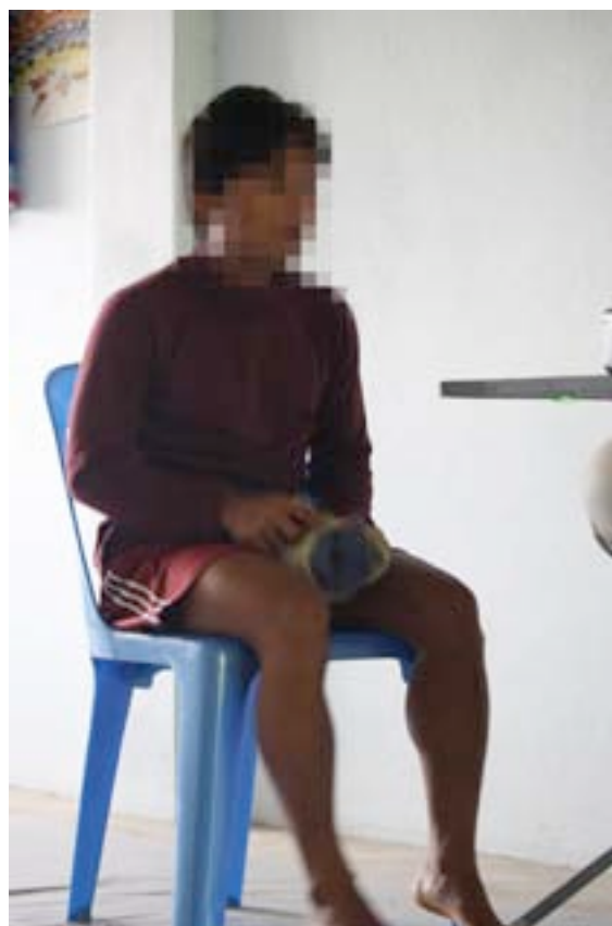
This photo, taken on October 13 th 2009, shows Saw C---, age 20, on the day he was interviewed by KHRG. Saw C--- was forced to carry equipment and test for landmines in advance of DKBA patrols. He fled after seeing another porter step on a landmine.

They do nothing for their people. They do as they like; they torture villagers.