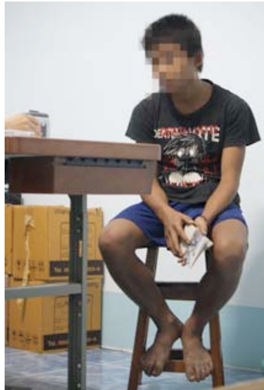
This photo, taken on October 13 th 2009, shows Pah G---, age 14, after he deserted from the DKBA in October 2009. He was forced to join the DKBA at age 13, and subsequently sent to a front line conflict area.

Yes, if the villagers refused an order, they [the DKBA] beat them. They also forced villagers to be their soldiers. If the villagers dared not to go [and be soldiers], they had to pay them [the DKBA] money. The villagers had to be DKBA soldier for the rest of their life. Each person was hired for more than 100,000 [kyat; approximately US $104]. For the people who couldn't pay, they had to go by themselves even though they were afraid.